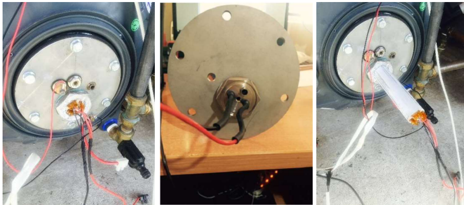
Figure 4 - Fit on flange