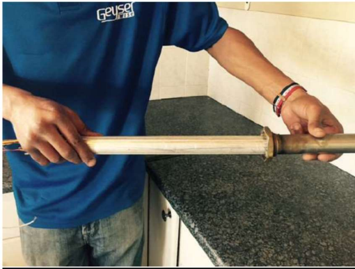
Figure 3 - Fit on flange